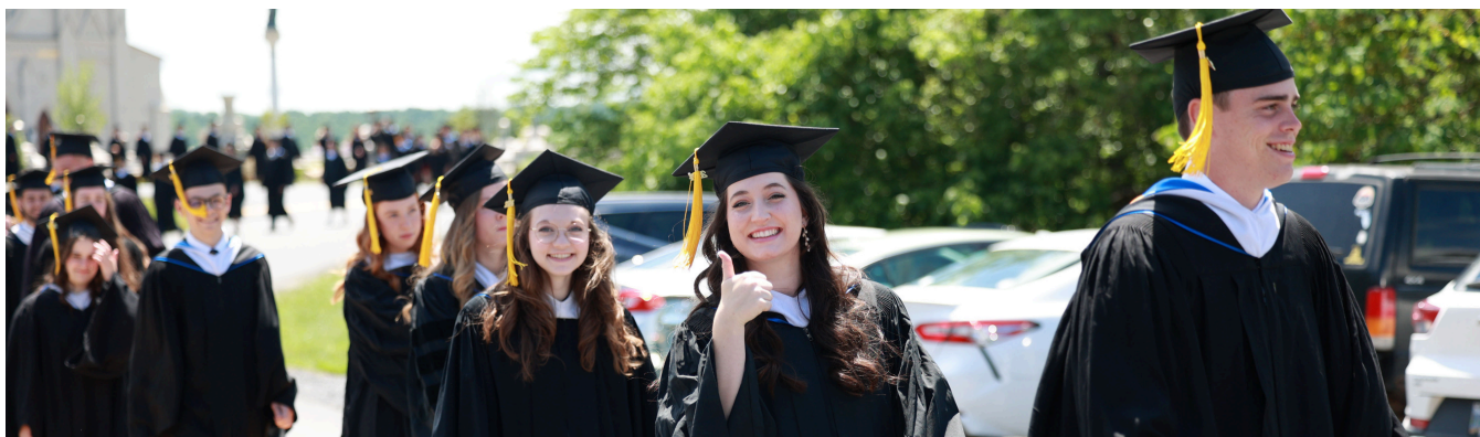
Christendom College in Front Royal, Va.

You can tell a lot about a person by the friends they keep. You can also tell a lot about a college by who it chooses as its commencement speaker or honorary degree recipient.