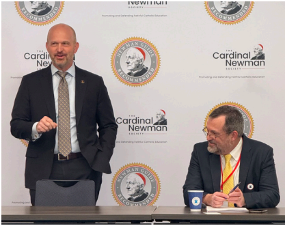
Kevin Roberts, president of The Heritage Foundation, at our Newman Guide leaders meeting on Jan. 23, 2025.

The meeting was co-sponsored by The Heritage Foundation , America's most influential public policy organization. It is led by Kevin Roberts, former president of Wyoming Catholic College and founding president and headmaster of John Paul the Great Academy in Lafayette, La. , formerly recognized on our Catholic Education Honor Roll. He's a fighter! And he is eager to help us defend religious freedom.