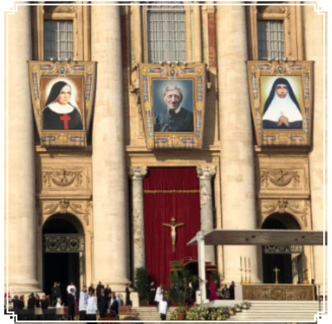
Canonization Mass at St. Peter's Basilica in Rome on October 13, 2019

(Pope Benedict XVI, Homily at the Beatification Mass of Cardinal John Henry Newman, 2010)