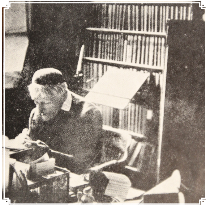
Photo of St. John Henry Newman at his oratory in Birmingham, England

(St. John Henry Newman, “Intellect, the Instrument of Religious Training,” Sermons Preached on Various Occasions )