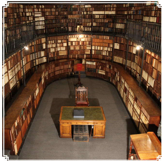
St. John Henry Newman's oratory library in Birmingham, England

(St. John Henry Newman, “A Form of Infidelity of the Day,” The Idea of a University )