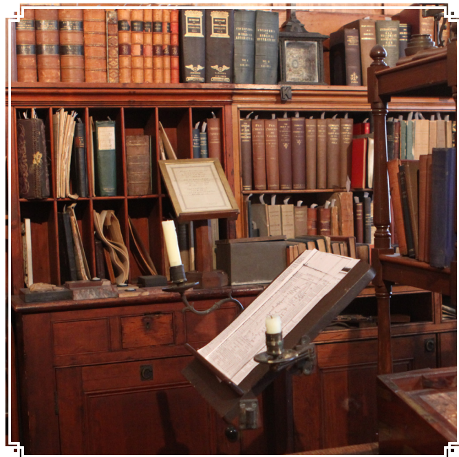
St. John Henry Newman's standing desk at his oratory in Birmingham, England

(St. John Henry Newman, “The State of Innocence,” Parochial and Plain Sermons )