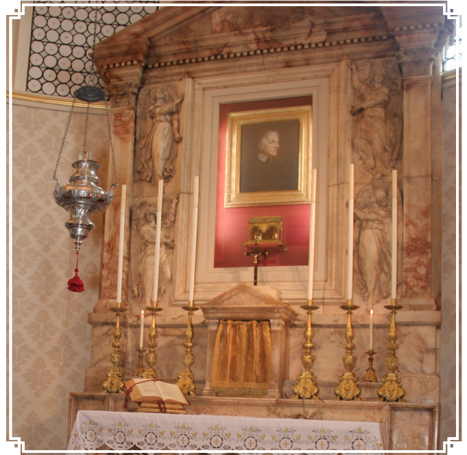
Chapel with Newman relic at his oratory in Birmingham, England

(St. John Henry Newman, “Duties of Catholics Towards the Protestant View,” Lectures on the Present Position of Catholics in England )