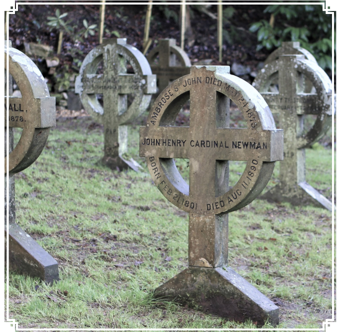
Gravestone in Birmingham, England, inscribed on the back, “ Ex umbris et imaginibus in veritatem ”

(St. John Henry Newman, upon being elevated to Cardinal, 1879)