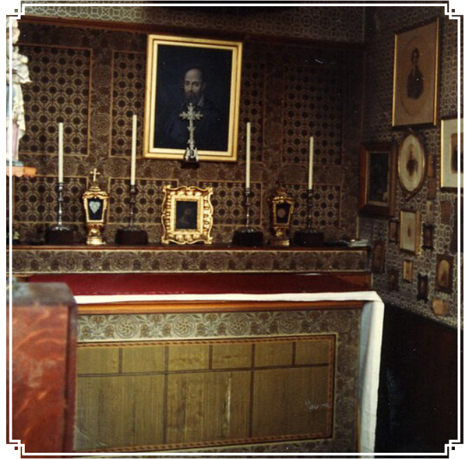
St. John Henry Newman's private chapel at his oratory in Birmingham, England

(St. John Henry Newman, “Knowledge Its Own End,” The Idea of a University )