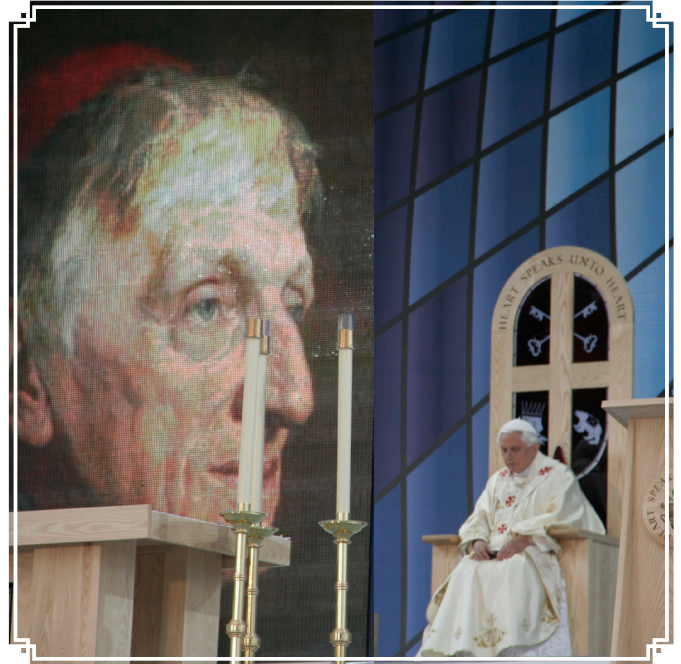
Beatification by Pope Benedict XVI in Birmingham, England, on September 19, 2010

(St. John Henry Newman, “Duties of the Church Towards Knowledge,” The Idea of a University )