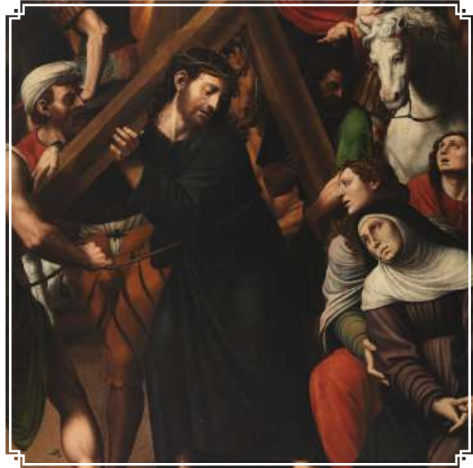
Christ on the Route to Calvary (1536-1538) Juan de Juanes, Vicente Juan Masip

(Because by Thy Holy Cross, Thou hast redeemed the world.)