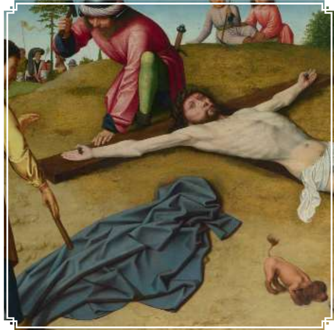
Christ Nailed to the Cross (1491) Gerard David

(Because by Thy Holy Cross, Thou hast redeemed the world.)