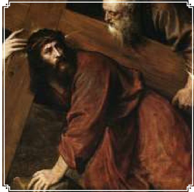
Christ Carrying the Cross (1560) Titian

(Because by Thy Holy Cross, Thou hast redeemed the world.)