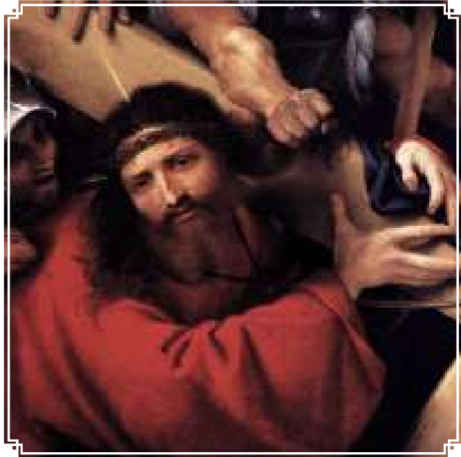
Christ Carrying the Cross (1526) Lorenzo Lotto

(Because by Thy Holy Cross, Thou hast redeemed the world.)