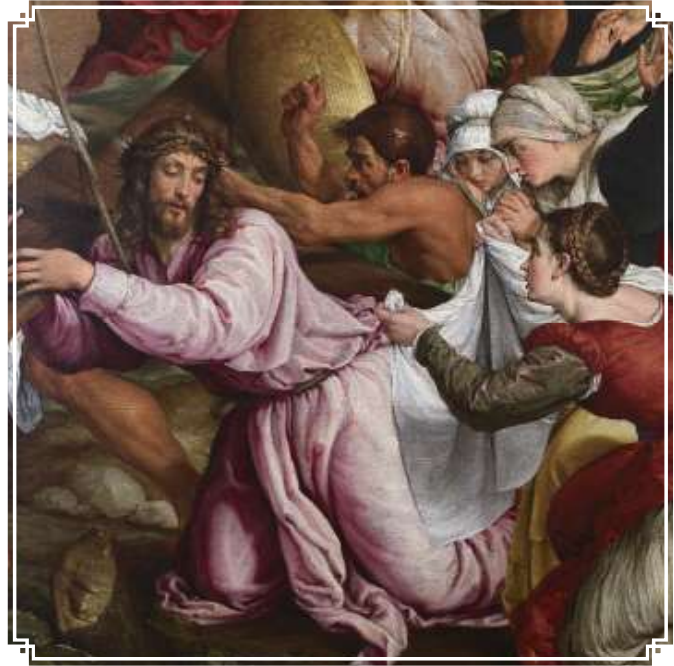
The Way to Calvary (1540) Jacopo Bassano

(Because by Thy Holy Cross, Thou hast redeemed the world.)