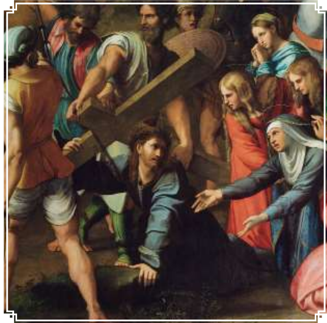
Christ Falling on the Way to Calvary (1516) Raphael

(Because by Thy Holy Cross, Thou hast redeemed the world.)