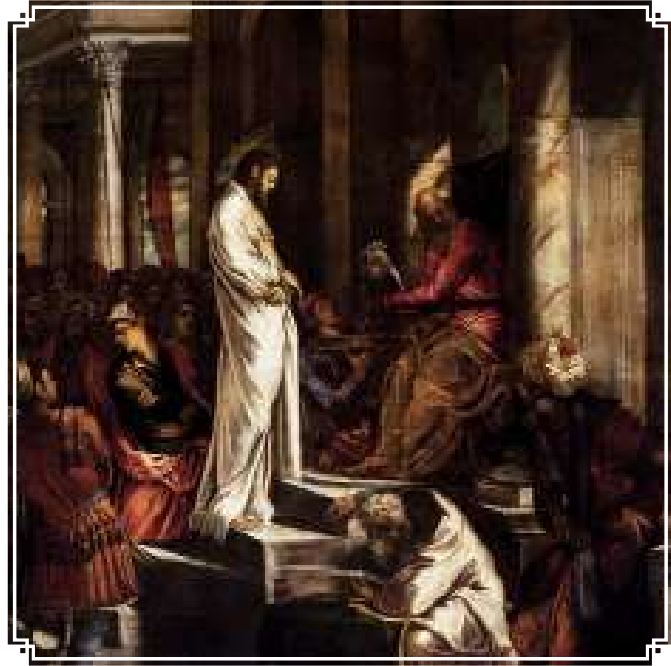
Christ before Pilate (1566-1567) Jacopo Tintoretto

(Because by Thy Holy Cross, Thou hast redeemed the world.)