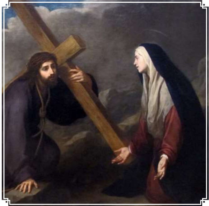
Christ Meets the Virgin Mary on the Way to Calvary (1665-75) Bartolomé Esteban Murillo

(Because by Thy Holy Cross, Thou hast redeemed the world.)