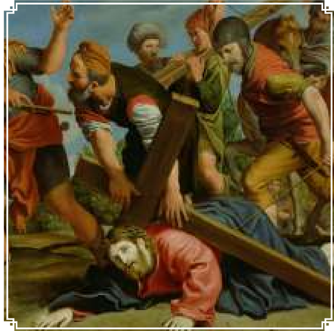
The Way to Calvary (1610) Domenichino (Domenico Zampieri)

(Because by Thy Holy Cross, Thou hast redeemed the world.)