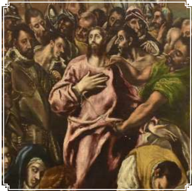
Jesus Christ Stripped of His Garments (1600) El Greco

(Because by Thy Holy Cross, Thou hast redeemed the world.)