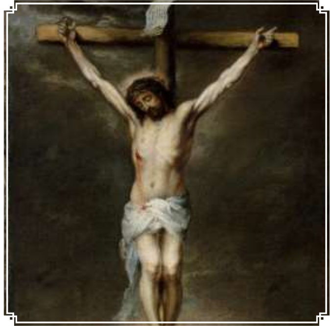
The Crucifixion (1675) Bartolomé Esteban Murillo

(Because by Thy Holy Cross, Thou hast redeemed the world.)