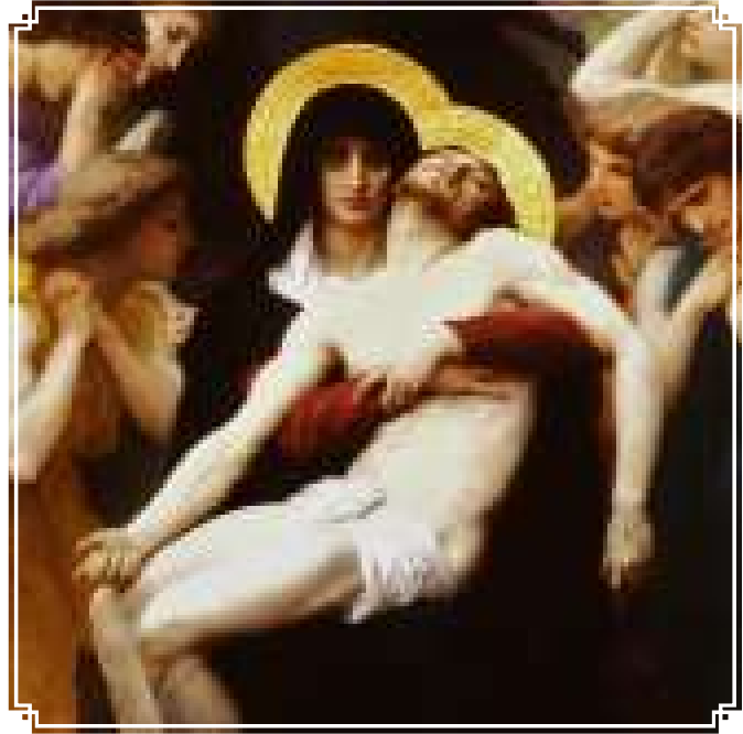
Pieta (1876) William-Adolphe Bouguereau

(Because by Thy Holy Cross, Thou hast redeemed the world.)