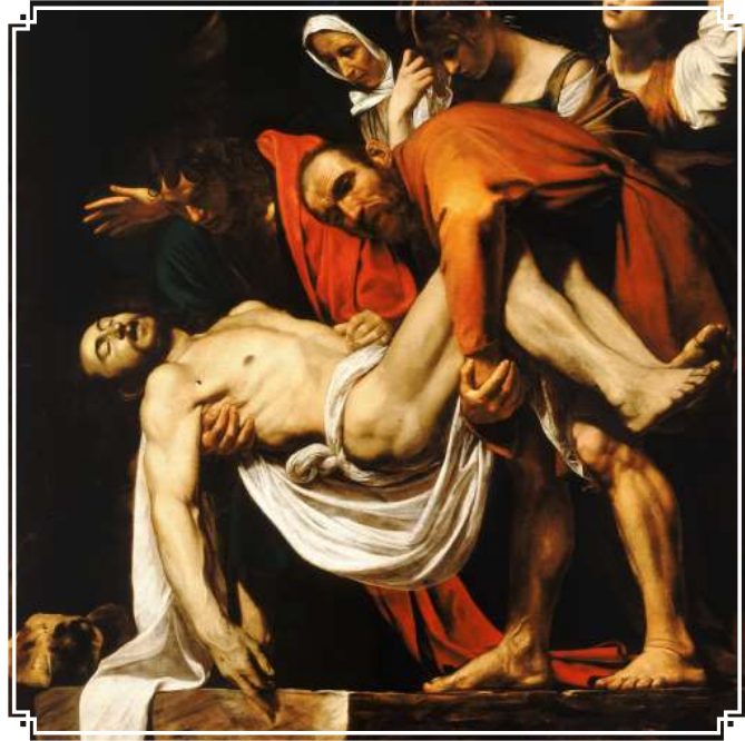
The Deposition of Christ (1602-1603) Caravaggio

(Because by Thy Holy Cross, Thou hast redeemed the world.)