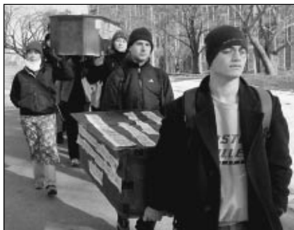
■ Students at Jesuit-run Boston College carry mock coffins last December as they protest a possible US-led military action in Iraq.

Alvernia College (Reading, PA) Avila University (Kansas City, MO) Cabrini College (Radnor, PA) College of Mount Saint Vincent (Bronx, NY) College of New Rochelle (New Rochelle, NY) College of Saint Catherine (St. Paul, MN) College of Saint Mary (Omaha, NE) College of the Holy Cross (Worcester, MA) Creighton University (Omaha, NE) Fairfield University (Fairfield, CT) Gannon University (Erie, PA) Gonzaga University (Spokane, WA) John Carroll University (University Heights, OH) Loyola College in Maryland (Baltimore, MD) Loyola Marymount University (Los Angeles, CA) Marian College (Indianapolis, IN) Marywood University (Scranton, PA) Mercyhurst College (Erie, PA) Molloy College (Rockville Centre, NY) Mount Saint Mary College (Newburgh, NY) Mount Saint Mary's College (Emmitsburg, MD) Notre Dame College (Cleveland, OH) Regis University (Denver, CO) Sacred Heart University (Fairfield, CT) Saint Bonaventure Univ. (St. Bonaventure, NY) Saint Francis College (Brooklyn, NY) Saint John's University (Jamaica, NY) Saint Mary's College (Notre Dame, IN) Saint Mary's College of California (Moraga, CA) Saint Mary's University (San Antonio, TX) Saint Norbert College (De Pere, WI) Saint Vincent College (Latrobe, PA) Salve Regina University (Newport, RI) Santa Clara University (Santa Clara, CA) University of Notre Dame (Notre Dame, IN) Viterbo University (LaCrosse, WI) Wheeling Jesuit University (Wheeling, West VA) Xavier University (Cincinnati, OH) ■