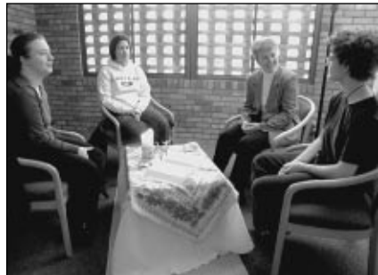
■ A Franciscan sister meets with students at Clark College in Oregon preparing to enter the Catholic Church.

I think the notion of, "Here's Catholic teaching; take it or leave it," is better than nothing, but it is still far from the mark, and doesn't really approach formation. Ultimately, of course, each human being is free to exercise his will, but to present Church teaching at a Catholic college as neutral or as one of many offerings in the cafeteria of belief systems is more than just