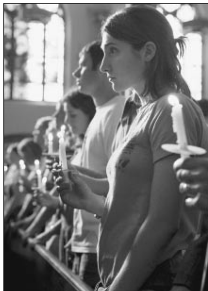
■ Students at a September 11, 2001 prayer service at Marquette University in Milwaukee.