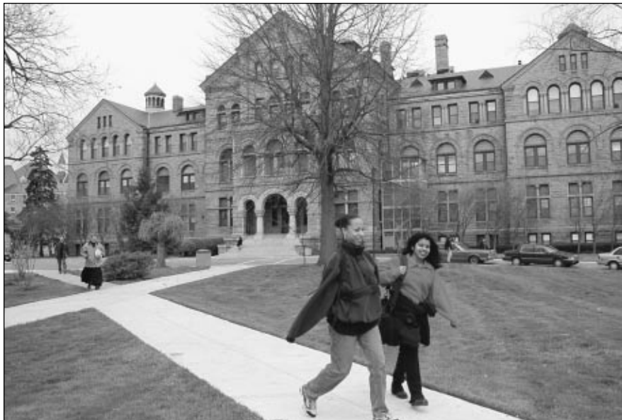
■ Students cross the campus of Catholic University of America in Washington, DC.

Catholic World Report and the Cardinal Newman Society—the national or-