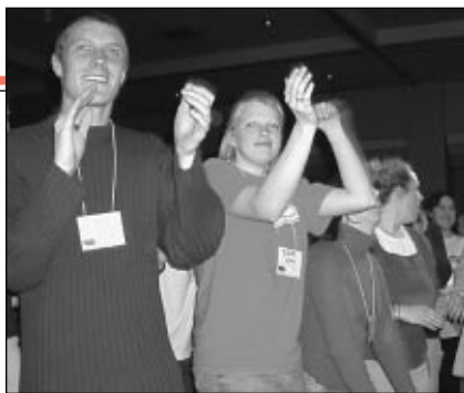
■ Students dance during a gathering of the Fellowship of Catholic University Students. The orthodox college outreach trains recent graduates to return to campus as faith leaders.